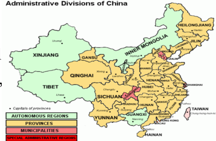
Administrative Divisions of China

“era national HUMILIATION” Geography isolated & united China-> worldview cultural superiority of Middle Kingdom- system Imperial rule & centralized bureaucracy- Confucianism as state ideology and written language but social & linguistic diversity in regions. Dynasties with Emperor’s “Mandate of Heaven”(only if just & virtuous)or overthrown. Centralized bureaucracy suited CCP. Eur & US invaded in late 1700’s gained unequal trade treaties-opium for spices after Japanese invasion independence under Mao 1949 disasters Great Leap Forward and Cultural Revn but redistribution land & power. 1972 recognised by Nixon & Whitlam. Ended central planned economy- more market driven but accepted hierarchy. Traditional memory = grandeur of past enlightened, advanced country Historical memory = entitlement after victimization