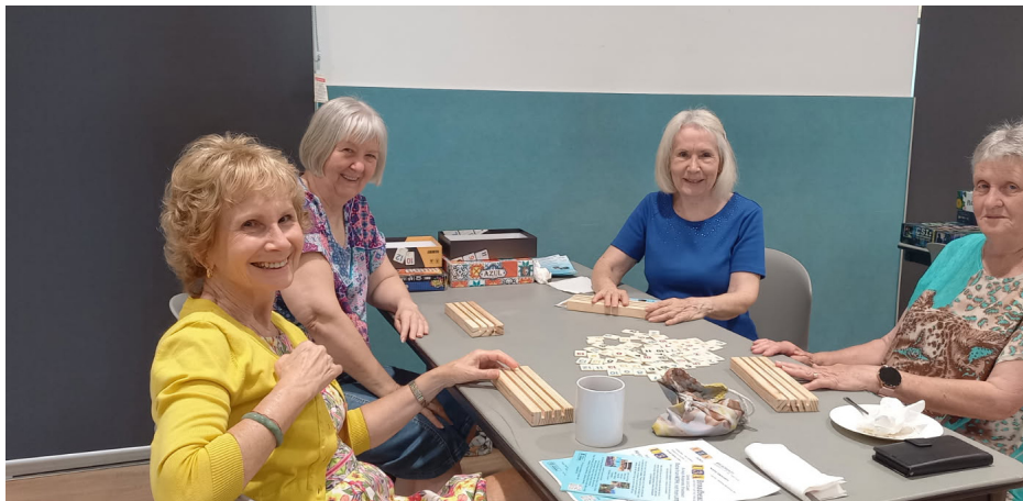
Open Day, Mudgeeraba

Let them know that they are not alone and there are people who care about them. Keep in touch.