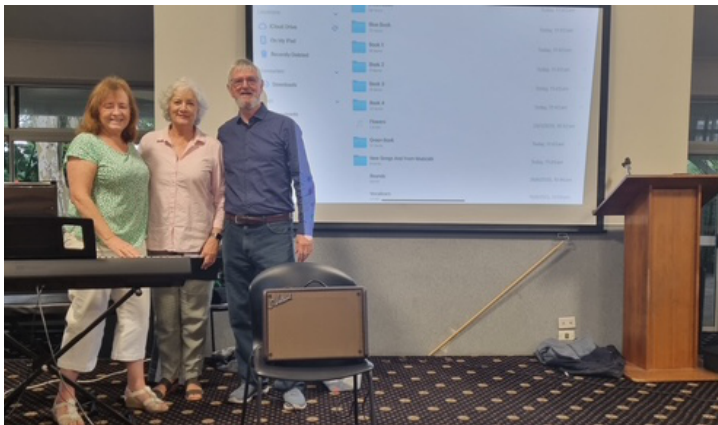
The Choir leaders proudly showing off new projection facility

The choir is a singing for fun group meeting on Wednesdays at 2.30 at Burleigh Waters Community Centre. A wide variety of song lyrics are now projected so it is easy to join without the need to purchase or bring books. The emphasis is on fun rather than formality and everyone is welcome irrespective of singing ability.