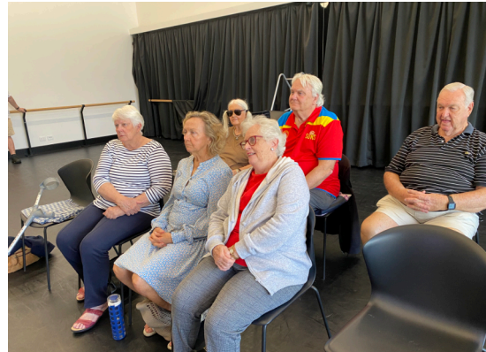
Part of an enthusiastic group