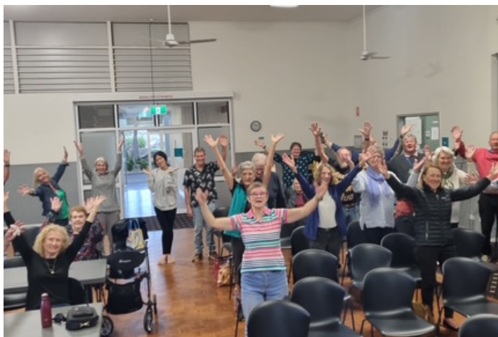
The Choir celebrates another triumphant rendition